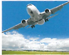
120 dB. Jet takeoff

The superior quiet operation of a Summit heat pump lets you enjoy a normal conversation in the serenity of your own backyard.