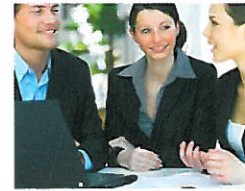
60 dB. Normal conversation