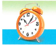
80 dB. Alarm clock