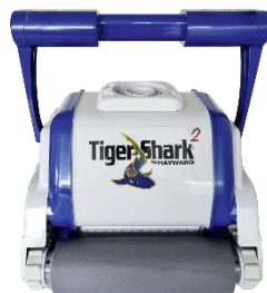
TigerShark 2 with foam roller

The TigerShark 2 with a 100ft cable and longer cleaning cycle is available for commercial pools and large pools.