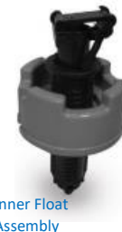
Inner Float Assembly

"SmartSensing" also protects Paralevel so it will not cycle on and off rapidly, like other levelers. This limits the potential for premature failure and eliminates loud water hammer that could lead to damage to plumbing.