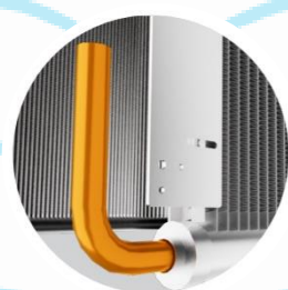
85% fewer braze joints

The new 5T HeatPro ® is more versatile and energy efficient for improved ambient heating and, with an increased cooling capacity compared to competitive technology in heat+chill models, it cools the water to lower temperatures making it ideal for warm or desert climates and for your plunge cold pool.