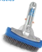
5" Brush with Stainless Steel bristles

Mix bristle brushes are also useful and long lasting. Stainless Steel bristle brushes must never be used on liner pools.