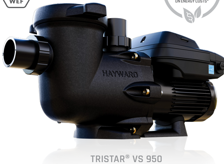
TRISTAR® VS 950