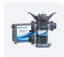
SALINE C® SYSTEM

*Standard Package includes Molded Flow Cell and Float-Style Flow Sensor