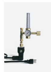
CO 2 FEEDER