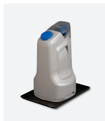
pH/Cl CHEMICAL FEED SYSTEMS