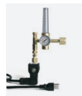
CO 2 SYSTEM