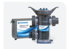
SALINE C® SYSTEM

*For international version information, please contact your local Hayward® Sales Representative.