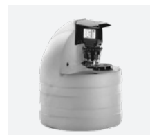
pH/Cl CHEMICAL FEED SYSTEMS