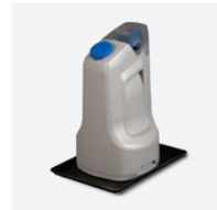
pH/Cl CHEMICAL FEED SYSTEMS