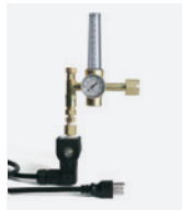
CO 2 FEEDER