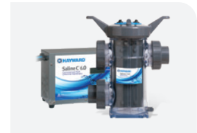
SALINE C® SYSTEM

*Standard Package includes Molded Flow Cell and Float-Style Flow Sensor